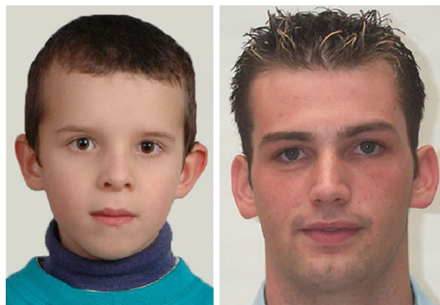
Fig. 2 An example of an attractive putative father and an unattractive boy (presented as his son) presented to students in Study 2

GLMM resulted in a significant model (Table 1). Neither the effect of the treatment nor the interaction between treatment \times father's attractiveness influenced the ratings of facial attractiveness of putative fathers (Table 1). Putative father's facial attractiveness was significantly influenced by facial attractiveness of putative sons, but this effect was restricted for the treatment where men were presented as biological fathers (not stepfathers) of their sons (Fig. 3). These results provide support for my hypothesis. The father's \times son's attractiveness interaction term suggests that the perceived attractiveness of unattractive fathers was more improved when they were presented with attractive putative sons, although this effect was weaker for attractive fathers. A final, three-way interaction term (Table 1) suggests that attractive