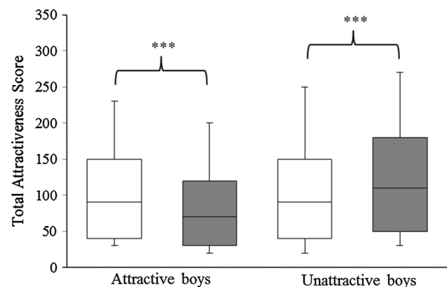
Fig. 1 The attribution of attractive boys to attractive ( open boxes ) and unattractive ( grey boxes ) putative fathers. Box plots represent medians, 25th and 75th percentiles, minimum and maximum values. The asterisks (***) denote statistically significant differences ( p < .001 ) based on the Wilcoxon matched-pairs test

A total of 260 undergraduate women with a mean age of 20.02 years ( SD = 1.94 ) participated for extra course credit. All the students attended the University of Trnava or St. Elisabeth