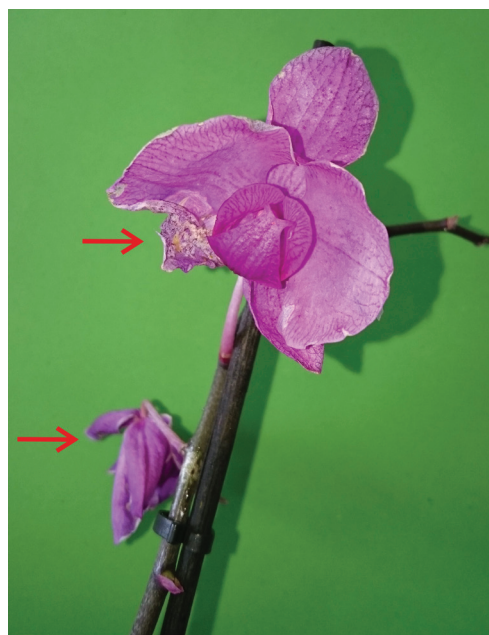
Figure 1. Visible injuries on Phalaenopsis orchid flowers caused by Dichromothrips corbetti

Hundreds of specimens, especially adult females and larvae, were obtained on potted orchid ( Phalaenopsis spp.) cultivars in two distant stores (first: